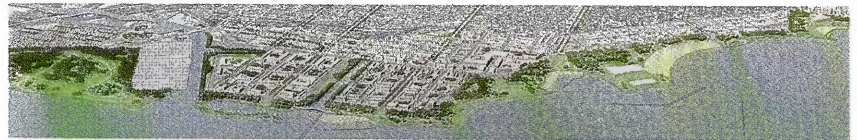
AERIAL VIEW OF THE PROPOSED SOUTHERN REACH, FROM THE EAST